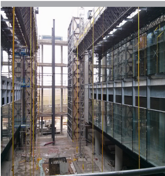
Use on site of various LVT73