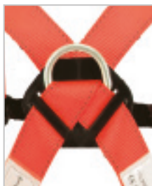
Dorsal anchor point