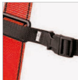
Control connection plastic loop