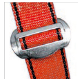
Control connection metal loop