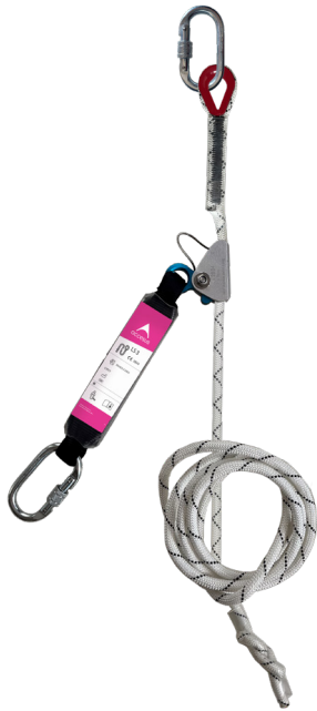
LS 3 lifeline