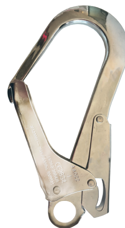
Scaffold Hook AA022