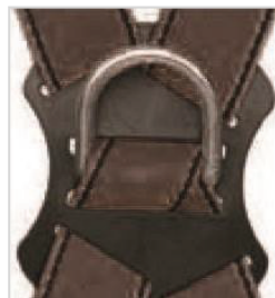
Back anchor point